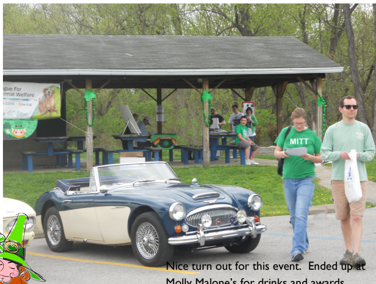
Nice turn out for this event. Ended up at Molly Malone's for drinks and awards.