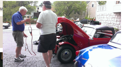
On the road tech sessions

Take 222 exit from 32 and go North (left). Immediately take 132 east bound to Dog Pound Road...Filager Rd. Turn Right on Meghans Run—address is on the left.