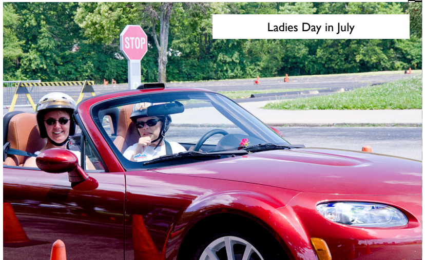
Ladies Day in July