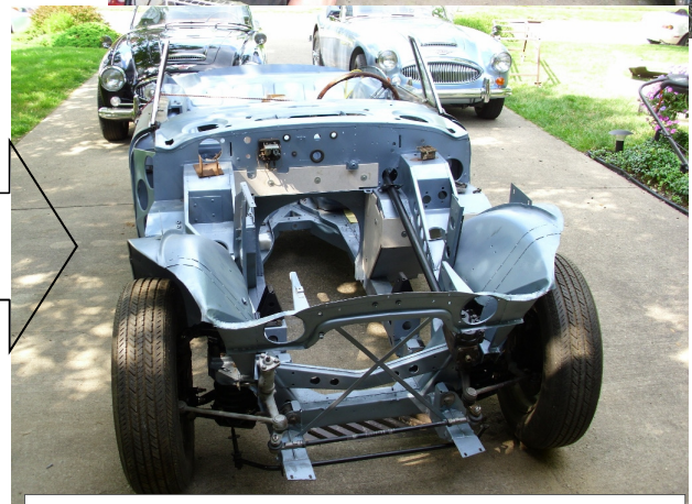
Tom Osborne now has a rolling chassis after 25 years