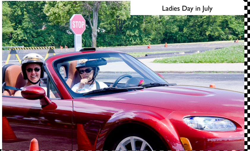
Ladies Day in July