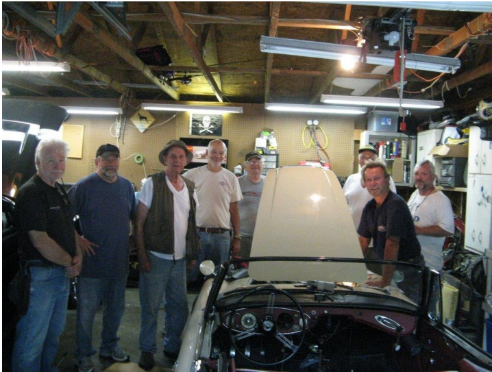
"Tech Session" October 5 th at the Bueckers.