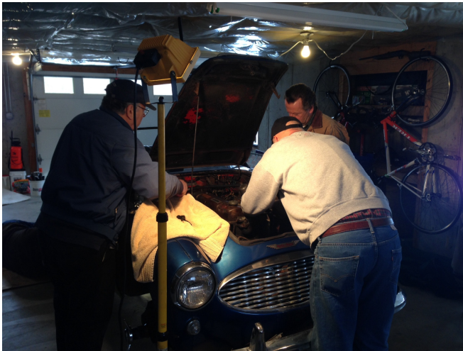
Note the lively green panels