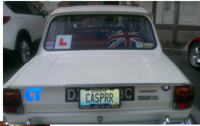
Cabbage Lips (trophy)