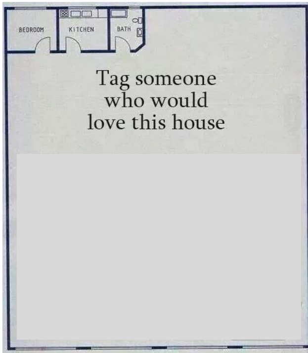
Bernie has had his retirement home drawn up. If I go first...this is the plan! Notice this has 4 garage doors...judging from the picture maybe 12 car garage?