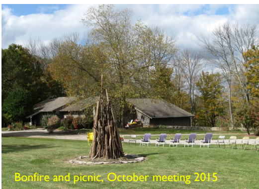
Bonfire and picnic, October meeting 2015

Minutes from the 2015 October OVAHC Meeting: