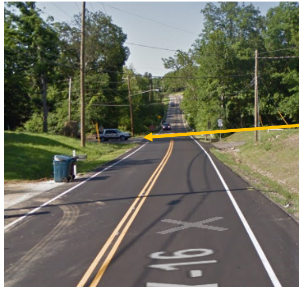
Rt. 2047 East, Klette Road

Still driving past Klette Road...here's a hint. The new road, Pride Parkway, is under construction and there are orange barrels and 2 lane highway. The road opens up to a nice new road with 4 lanes and no barrels. It then goes back to a 2 lane...start looking...Klette is on your left.