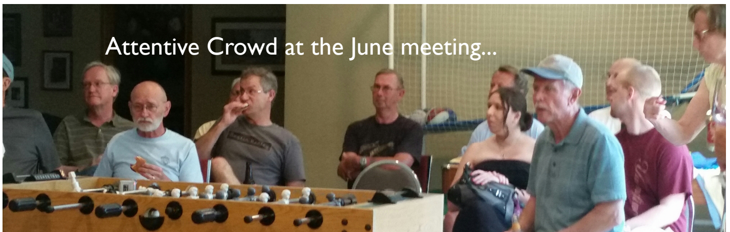
Attentive Crowd at the June meeting...