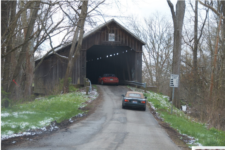
Spring car drive April 2016...it snowed!