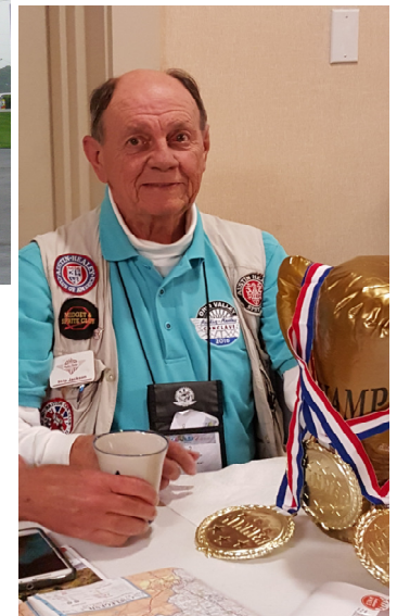
Skip for first Place for Bugeyes