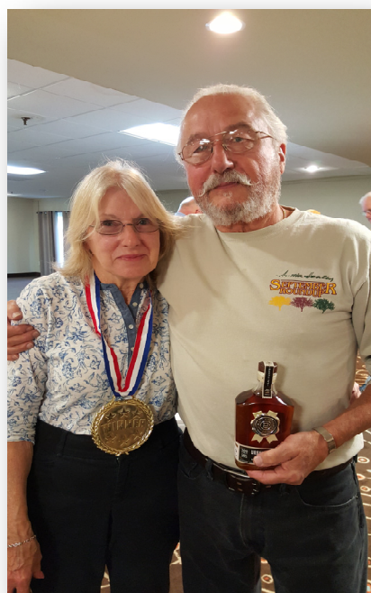
First in Big Healeys goes to Spurlocks, along with Best In Show