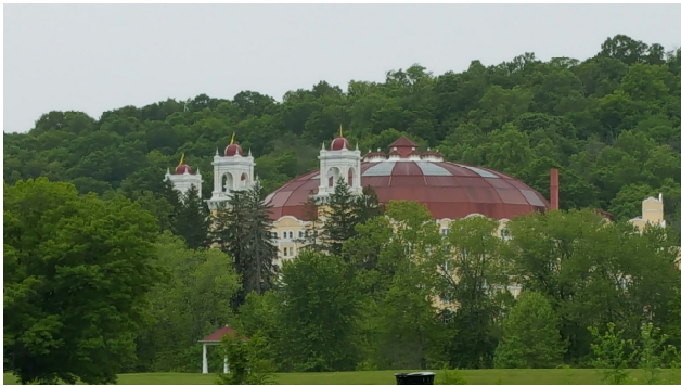
lunch...meeting up with lost group! More driving in the rain!