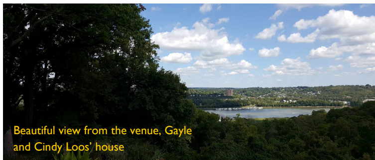
Beautiful view from the venue, Gayle and Cindy Loos' house