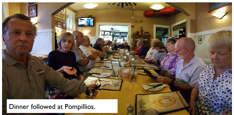
Dinner followed at Pompillios.