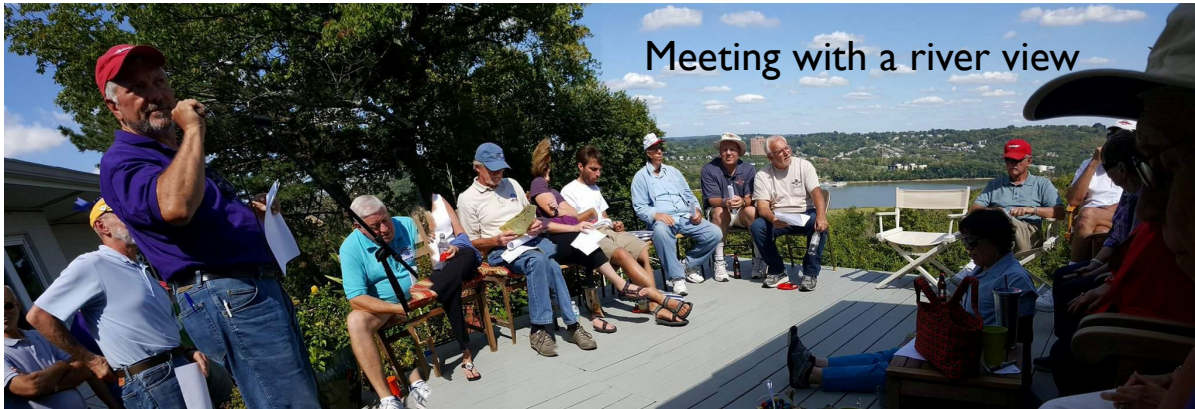
Meeting with a river view