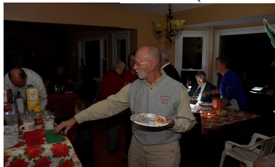
Dining in the dark...where's the bar?

Resourceful members of the AHC dining in the dark at the Grabow's. Lights came on short- ly after eating...in time to ex- change gifts and have a meeting!