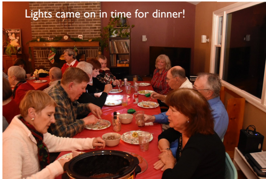
Lights came on in time for dinner!