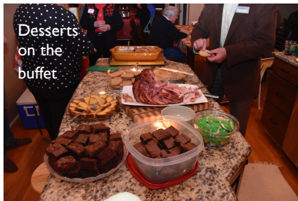
Desserts on the buffet