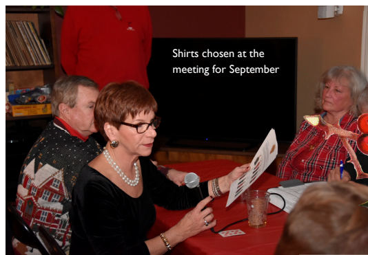
Shirts chosen at the meeting for September