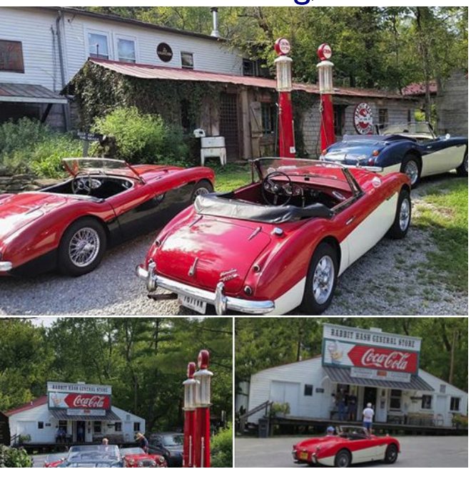
Drive to Rabbit Hash, KY for Road Rally