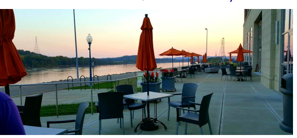
View from the Hotel