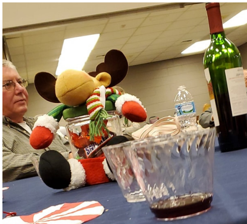
Table decorations and wine glasses. Great party!