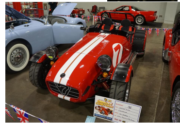
Mick's son's Lotus, also at CCofC 2019