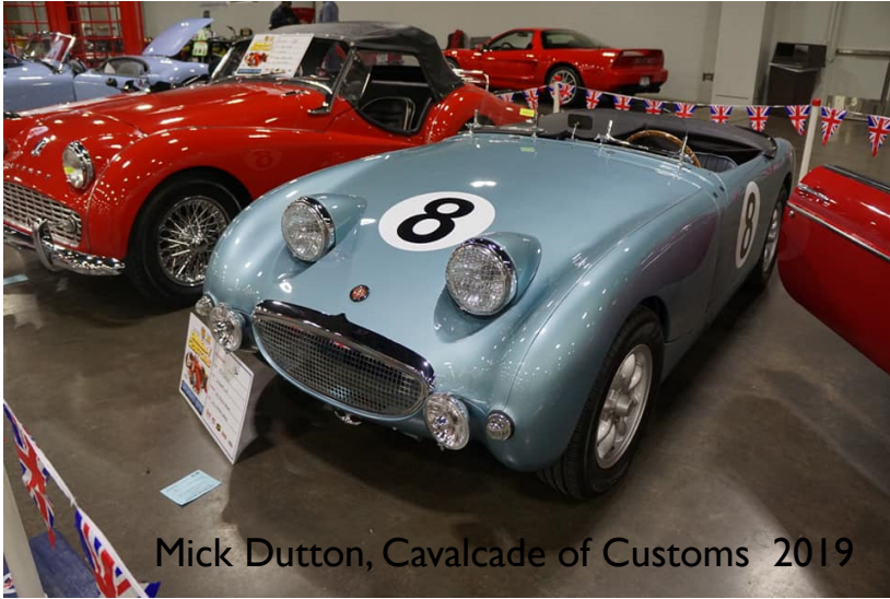
Mick Dutton, Cavalcade of Customs 2019