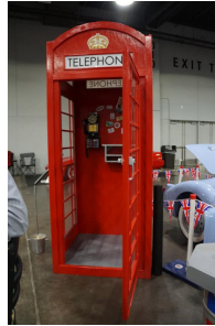
Cavalcade of Customs 2019