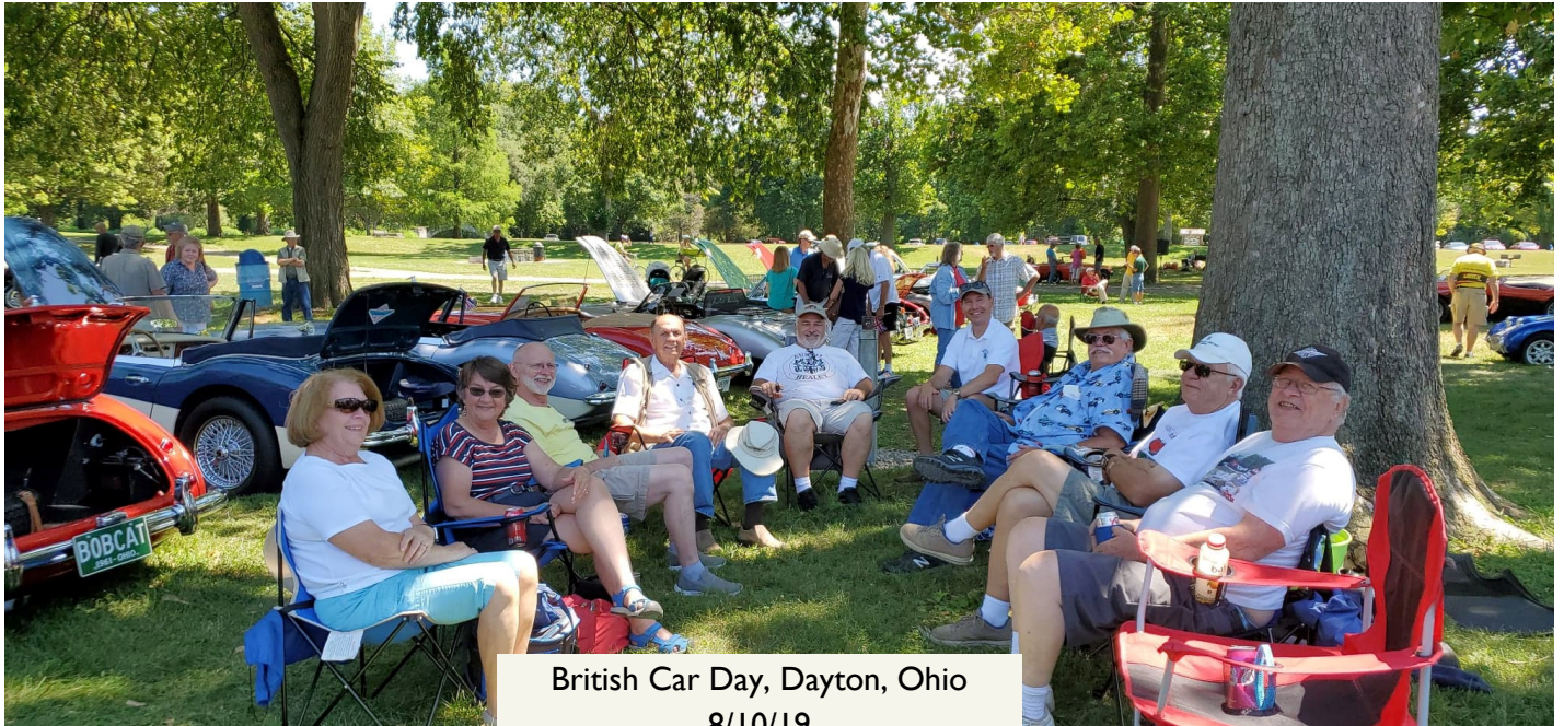
British Car Day, Dayton, Ohio 8/10/19