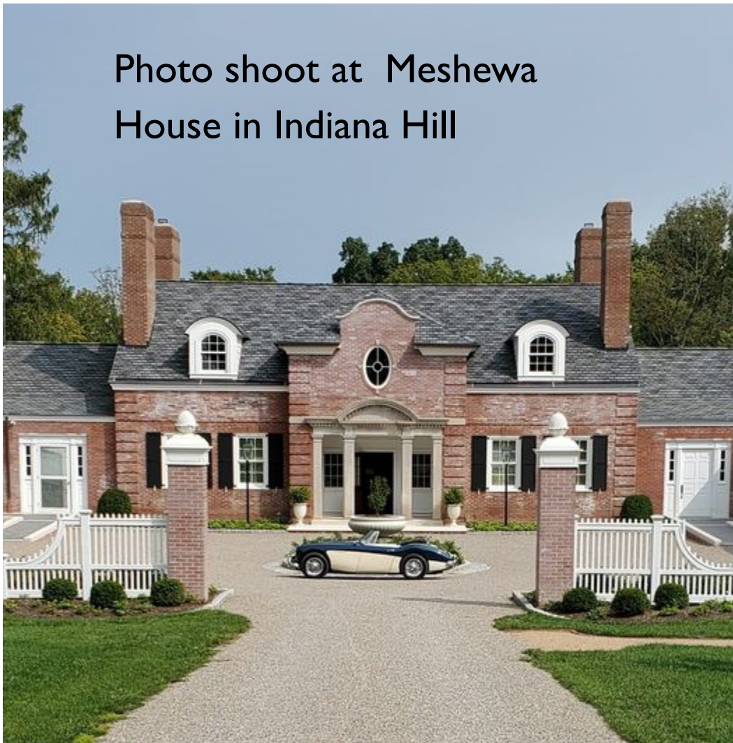
Photo shoot at Meshewa House in Indiana Hill