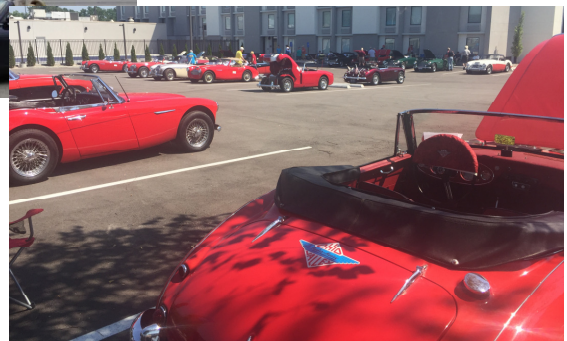
Casual Car Show