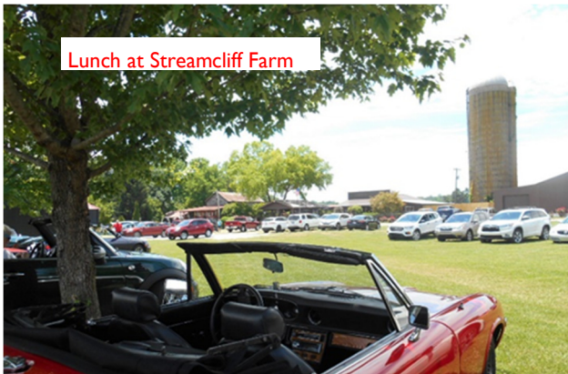
Lunch at Streamcliff Farm