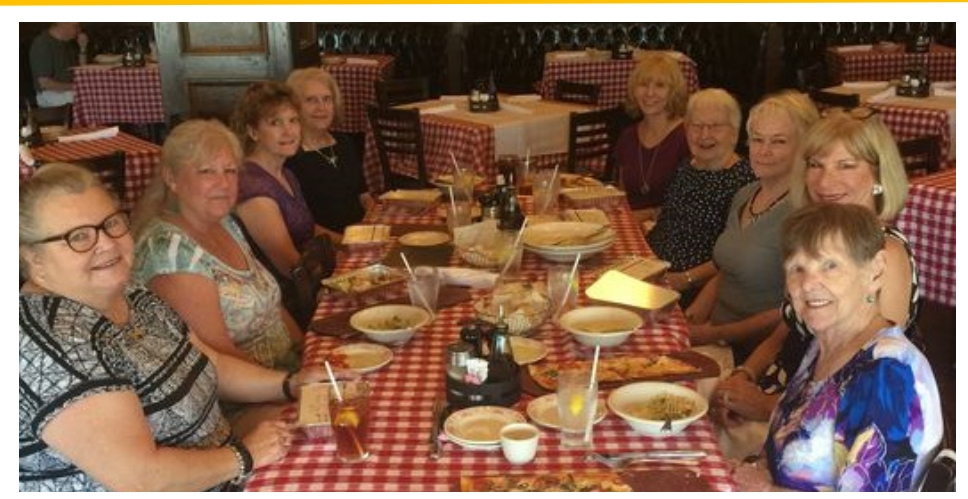
Healey Hotties at Margianos for lunch on 8/25