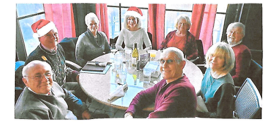
Wishing you a Merry Christmas!