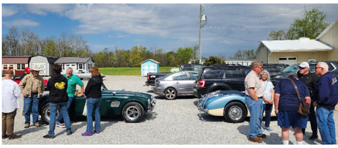
Drive to Maysville, Kentucky on a beautiful day. Visit to a miniature museum, bourbon tasting, lunch at the local pub and shopping on the main street. Would like to take this trip again!