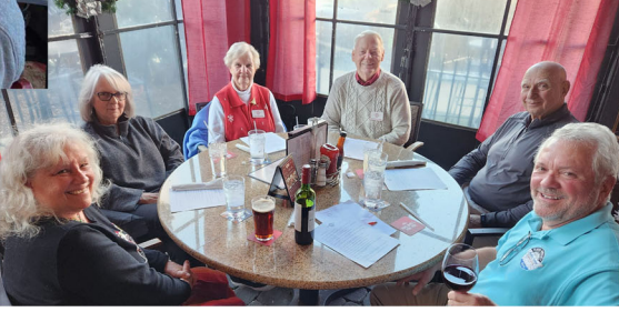
Christmas luncheon at The Pub in Rookwood, December 7, 2023.