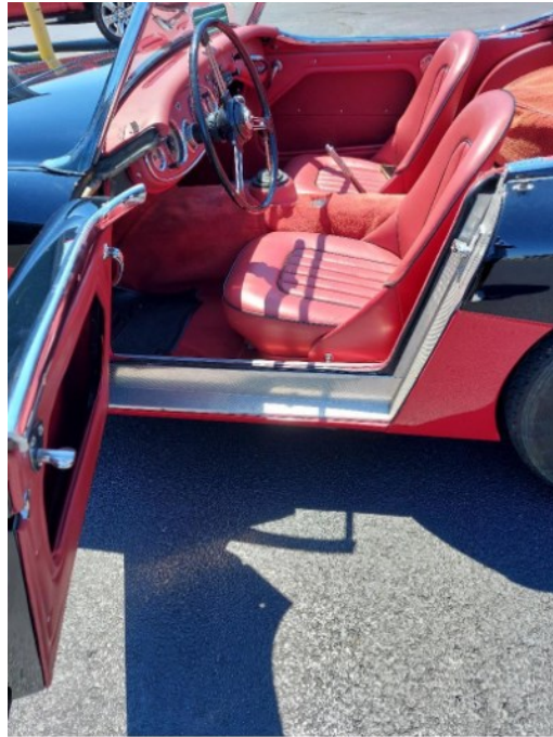
Restored 1962 A-H 3000 BN7 Mark 2 Sidney, Ohio 45365 (near 75 far up north) Bob Alexander from Dayton AHC

For Sale: 1958 Austin-Healey Bugeye Sprite & priced to sell! Restored and upgraded with a 1275 engine and front disc brakes, Yellow with black racing stripes, Competition steering wheel, 4 speed factory tranny, air horns, electric fuel pump, still has the generator, Mini Lite style wheels, up-graded rolled and pleated seats, Asking $14,999, located in Edgewood, KY near I-275 and Cincinnati, OH, runs good and ready to go! call John or Karen Haines at 859-907-3515. jdhaines@fuse.net , kshaines@fuse.net for email questions.