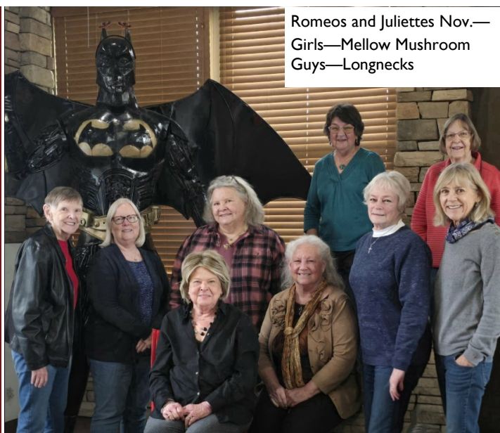
Romeos and Juliettes Nov.— Girls—Mellow Mushroom Guys—Longnecks