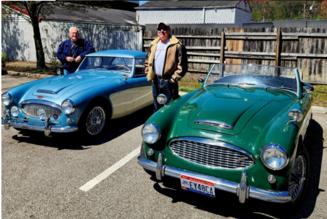
ATP in Anderson for the Romeos in April.