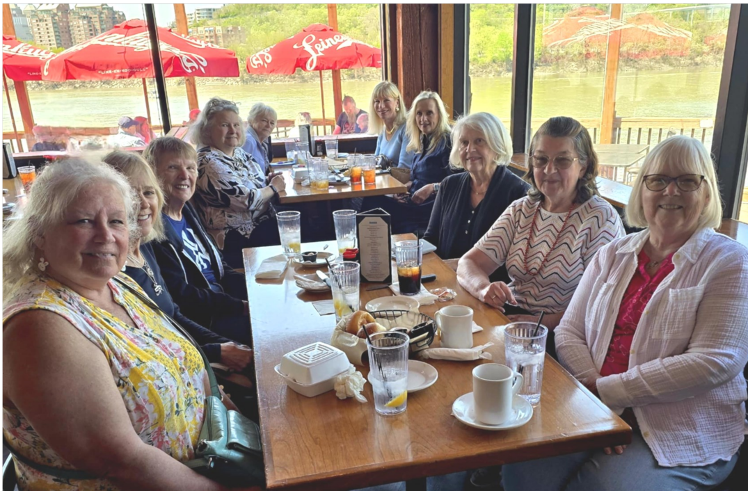
Juliets at Buckheads in April