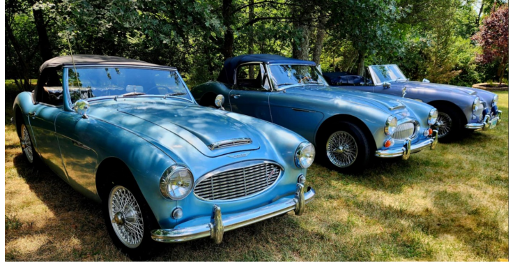
This was a “blue car day” at our August meeting.

* Need to provide details and asking price to the British Car Club newsletter editor.