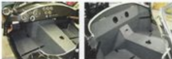
Koolmat insulation material installed in a Cobra.

Directions to the Koolmat shop in Mooresville at 149-B Rolling Hill Rd., Mooresville, NC 28117: Exit 36 on I-77 turn left (west)... turn left at traffic light at the Chick Filet into Lakeside Race Park... Koolmat is the 3rd building from end