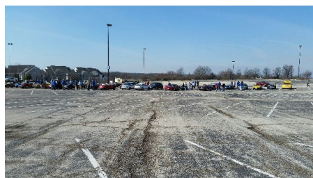
Wide view of Polar Bear