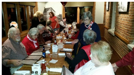
GHA Valentine Dinner