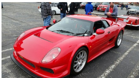
Mike's 2004 Noble