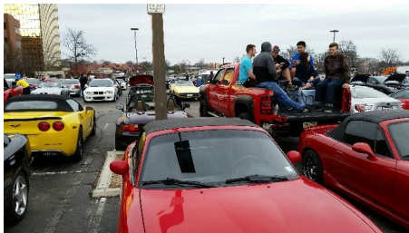
Party Atmosphere at Cars &amp; Coffee