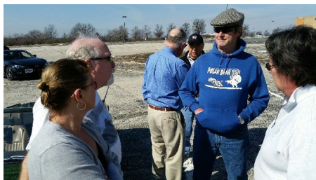
Polar Bear Run Folks