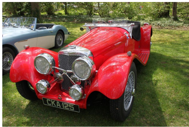
Jaguar Replica with XKE drive train