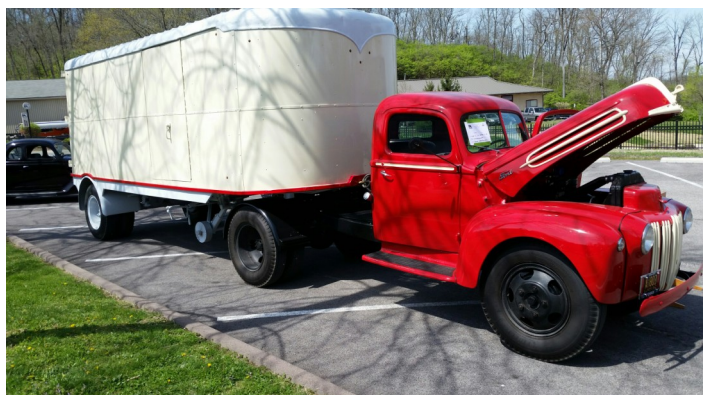
Ford Tractor Trailer