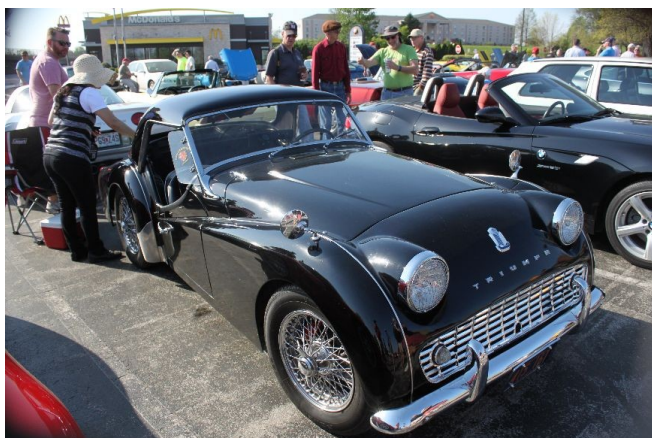
Perfect Lady Friend waxing TR3 LBC