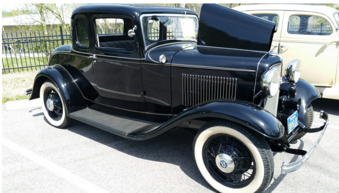
First Ford with a V8