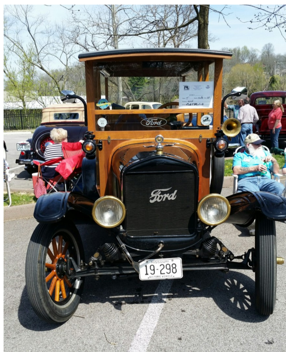
Model T Depot Hack