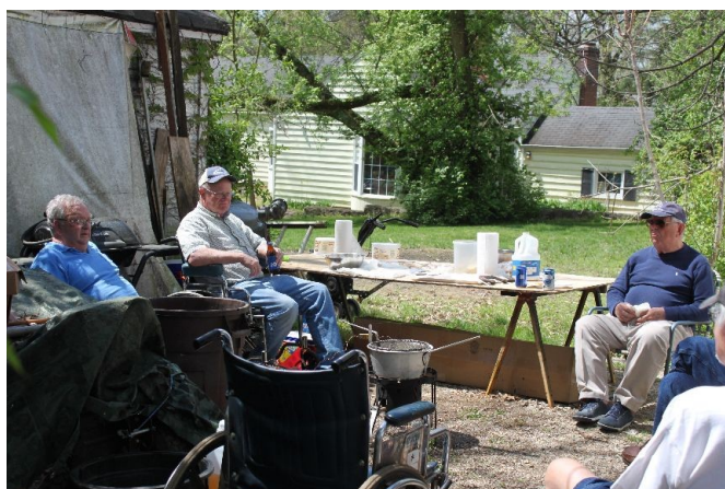
Boys watching Shrimp Fry