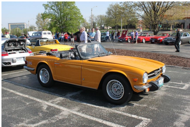
Richard's TR6 with new master brake cylinder