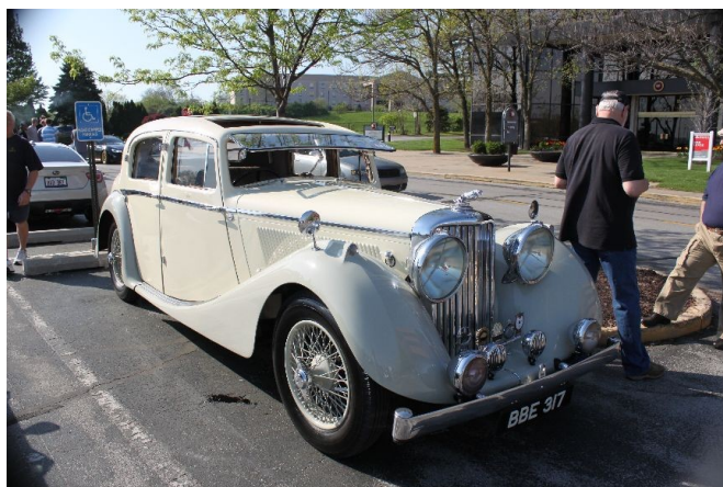
Old, old Jaguar