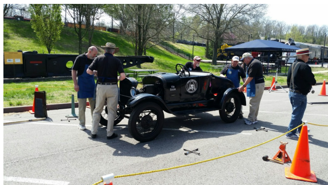
Assembling a Model T