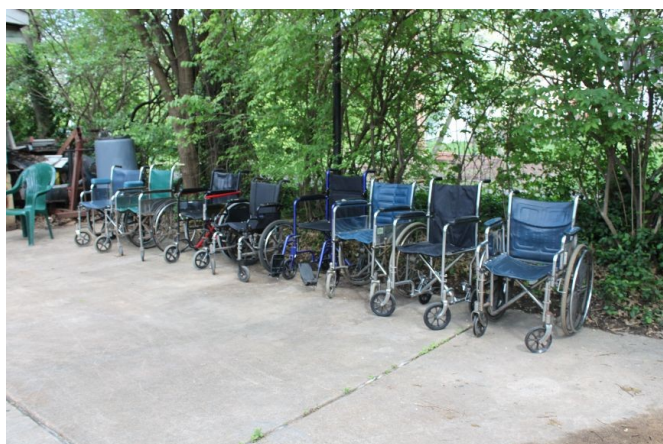
I know club membership getting older but this bad!