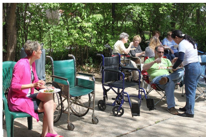
Ladies enjoying wheel chairs