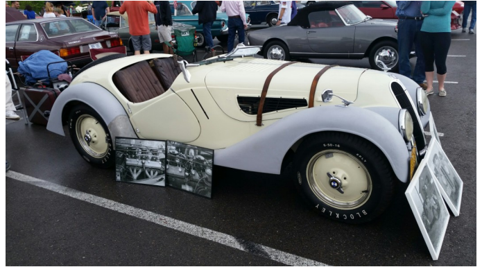
1937 BMW 328