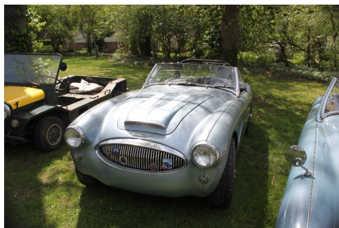
Keith's '62 AH 3000