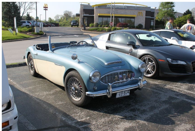
Jim Reiter's AH 3000