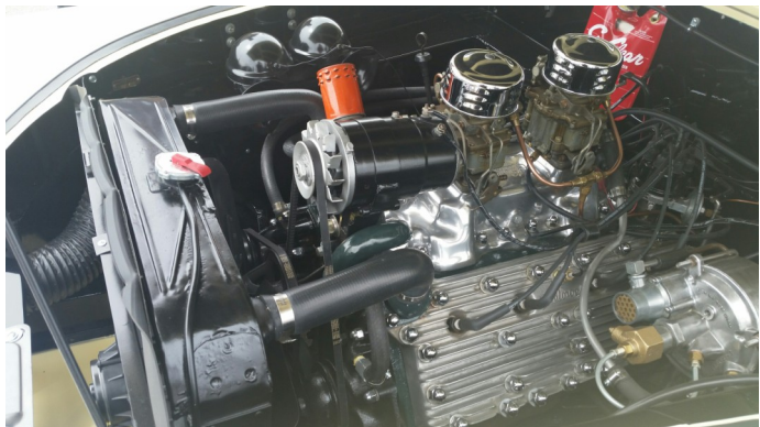
Muntz Lincoln Engine