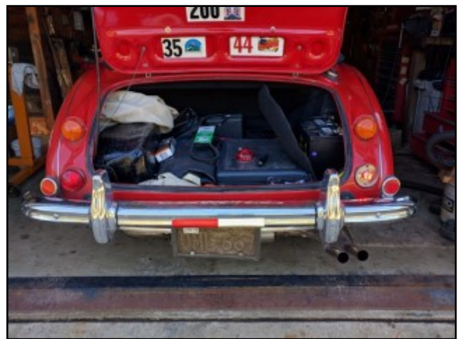
Above: ...In with the new!

And then there is the aforementioned problem with the turn signals. Austin Healey employs an overly complicated turn signal light wiring arrangement that is not compatible with LEDs, and the stock flasher unit won't work with them either. There are work-arounds for these problems, of course, but it certainly complicates matters! Also, LED bulbs come in several colors, which must be matched to their application...yikes!