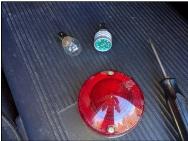
Above: Out with the old...

Upon visiting http://www.mossmotoring.com/led-installation-and-common-issues/ , it becomes apparent that there is more to this job than replacing a couple of little bulbs. While LEDs are light sources, they are also diodes...an electrical gadget that allows current to flow in only one direction. Since most cars nowadays are wired for negative earth, there is a greater variety of LED bulbs for these vehicles. I am guessing Moss has purposely avoided probable headaches by not offering the positive earth versions.