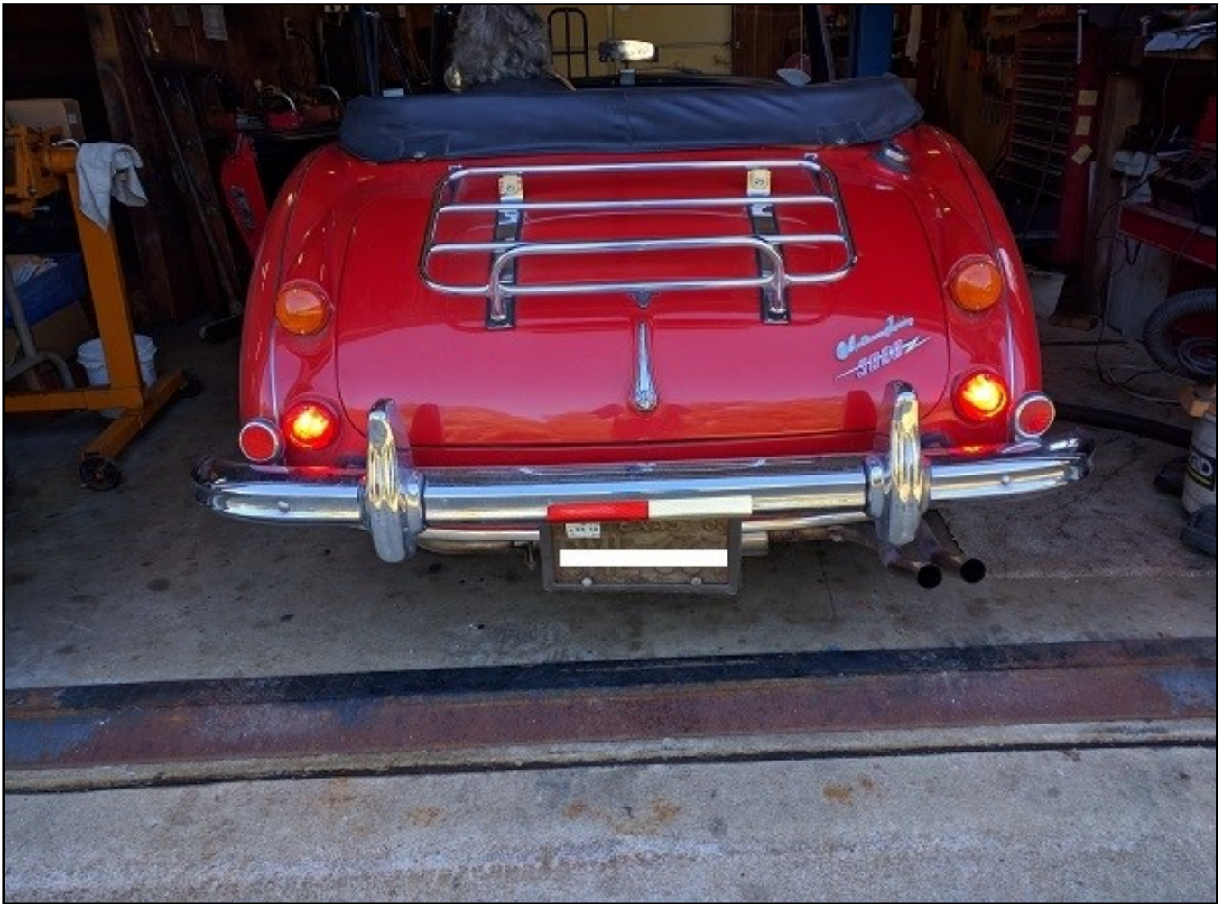
Above: Mighty bright!