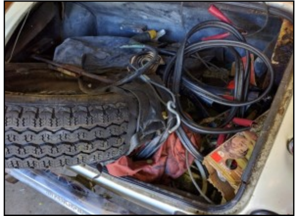
Above: Junk in the trunk...

With only 55,000 original miles, the engine started on the first crank as if it was never sidelined. The frame and body are surprisingly solid for a car that spent some time near the ocean. In reality, a complete restoration would be the proper course of action...yet an original unrestored Austin-Healey 3000 that runs this well would be a lot of fun as is!