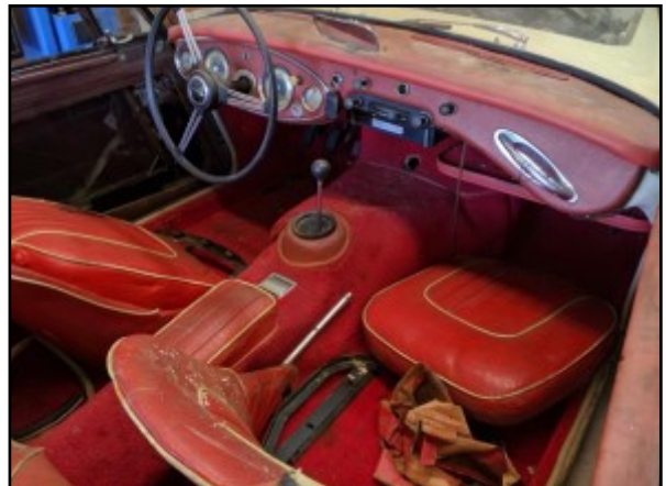
Below: Mouse house