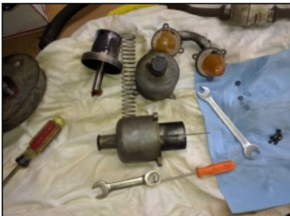
Above: Needs a good scrubbin'