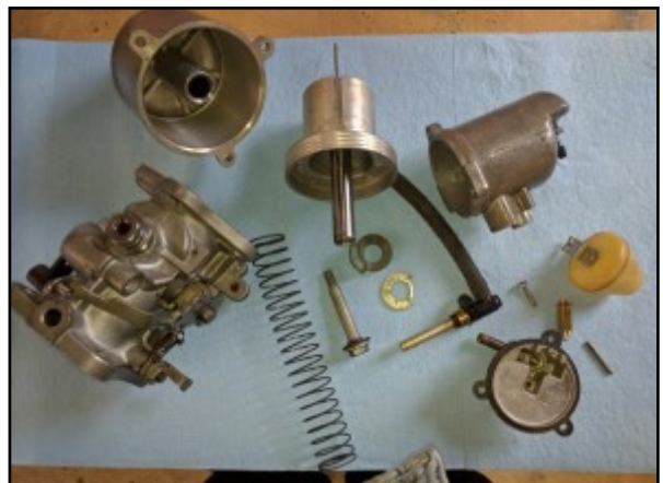
Above: Got a good scrubbin'