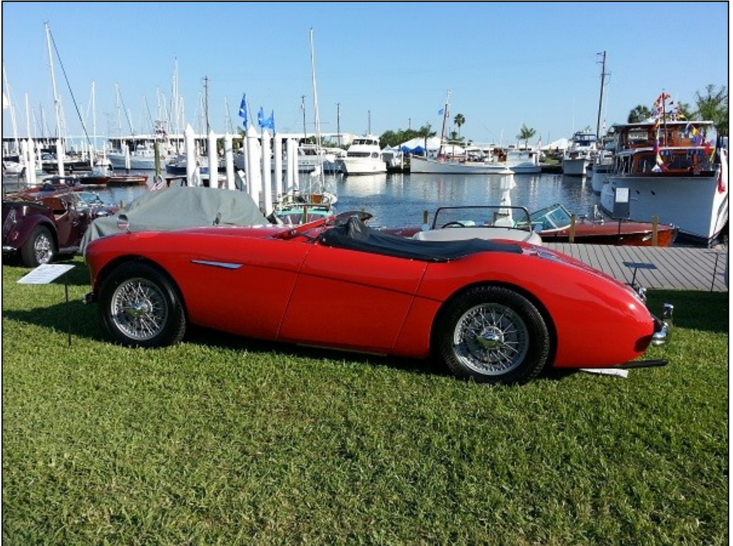
The Chronowski's 1954 BN1 at Keels & Wheels