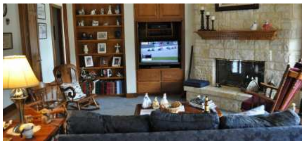
Unbearable mid-race excitement