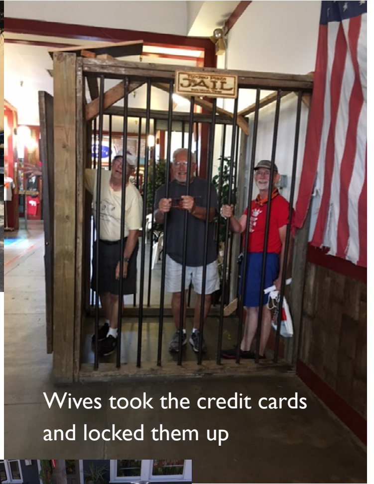
Wives took the credit cards and locked them up