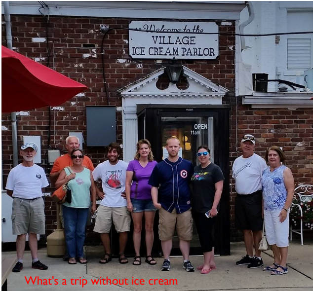
What's a trip without ice cream