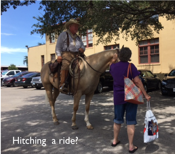
Hitching a ride?